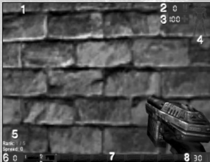
Default HUD shown

During the game, a variety of on-screen indicators, status meters, icons and messages will keep you abreast of important information and situations. Together, these informational aids comprise your Heads Up Display (HUD). Keep an eye on your HUD to stay in touch with the small details that may end up saving your life. Remember, an aware player is a living player.